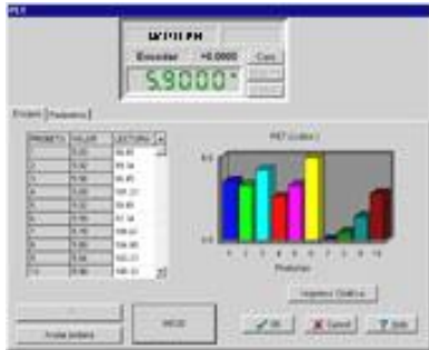
“Mullen” Index (kN/g, kPa.m 2 /g) Burst Resistance (kPa, PSI, Bar Kg/cm 2 )