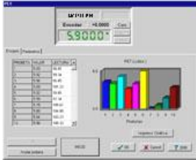
“Mullen” Index (kN/g, kPa.m 2 /g) Burst Resistance (kPa, PSI, Bar Kg/cm 2 )